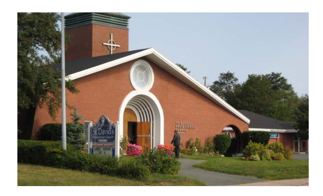
St. John's, Newfoundland and Labrador Congregation founded in 1775

St. David's Presbyterian Church ~Welcomes All ~