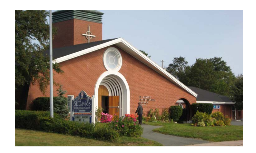
St. John's, Newfoundland and Labrador Congregation founded in 1775