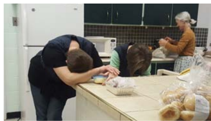
Prayer or relief? Or both?