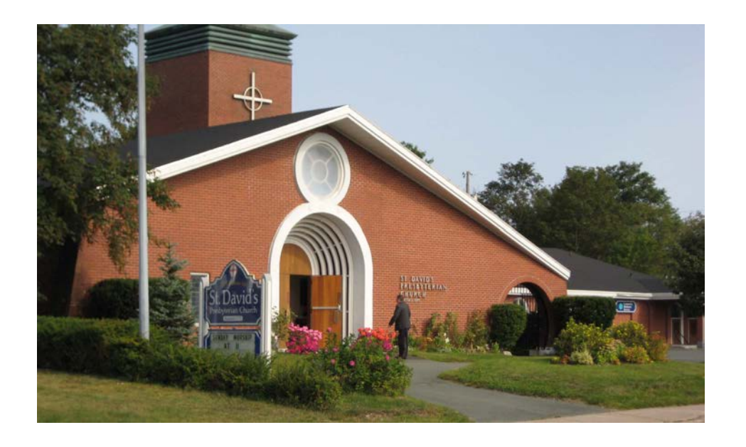
St. John's, Newfoundland and Labrador Congregation founded in 1775

In case of emergency, St. David's has an Automated External Defibrillator (AED)! It is located on the wall just outside the Church Office