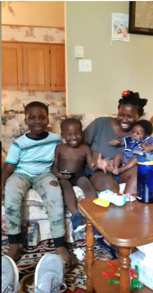
A Happy Family