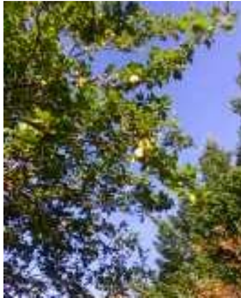
Apples High in the Tree

A couple of weeks ago, we saw John Green ready to harvest the apples off their tree. Well, it seems the apple trees on Random Island are producing well this year too. Lots of apple sauce ahead!