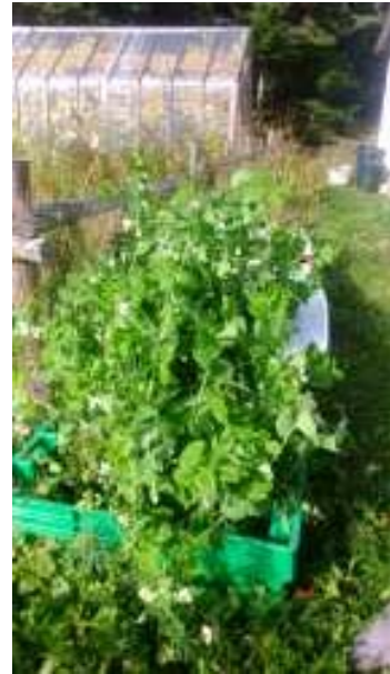
Bathtub of Green Peas

The greenhouse grapes are being picked and ready to be made into jelly and juice by some helpful friends up the road.