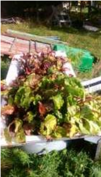
Bathtub of Beet

Seems like our Treasurer, Anne Calver, is busy over in Lady Cove. Anne has sent along some pictures of what's going on in her garden. Always one to put something to good use rather than throw it away, she has "re-purposed" 2 bathtubs as planters – with great success!