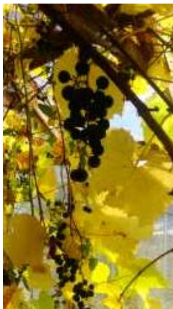
Grapes Ready to be Picked

The greenhouse grapes are being picked and ready to be made into jelly and juice by some helpful friends up the road.