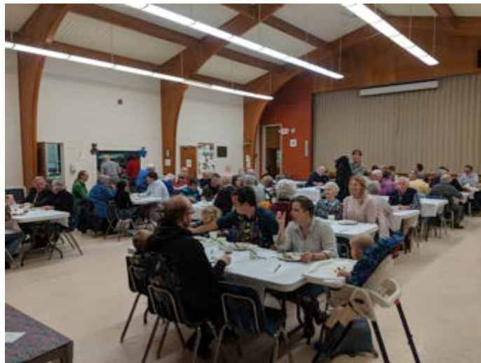
Pancake Night Feb 25, 2020