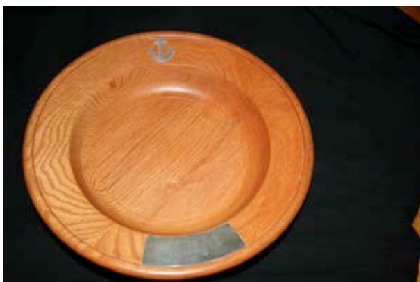
Commemorative Collection Plate