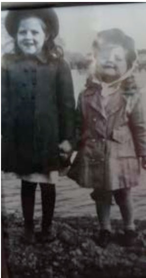
My Aunt and Mother when they were about 3 and 6

I will miss them but I have comfort knowing they are together again. There is no doubt my aunt is making my mother laugh once again!