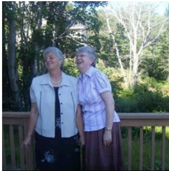
My Aunt and Mother at my Aunt's 50 th Wedding Anniversary Celebration