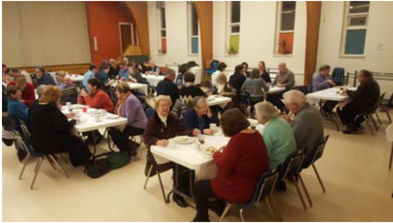
Pancake Night Feb 28, 2017