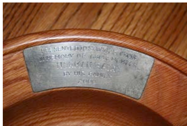
Inscription on Collection Plate