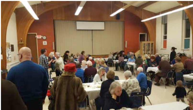
Pancake Night March 5, 2019