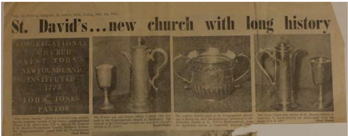
Evening Telegram Article (1965)