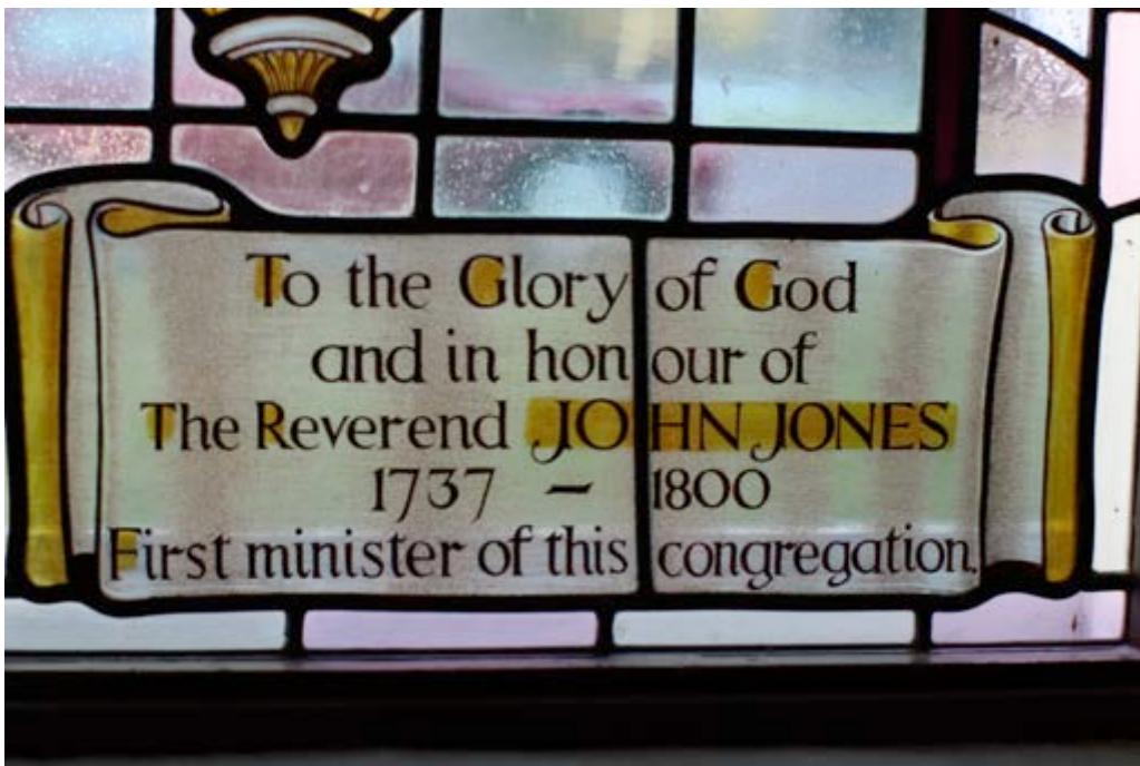
Inscription on Window