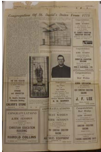
Article on St. David's (June 1966)