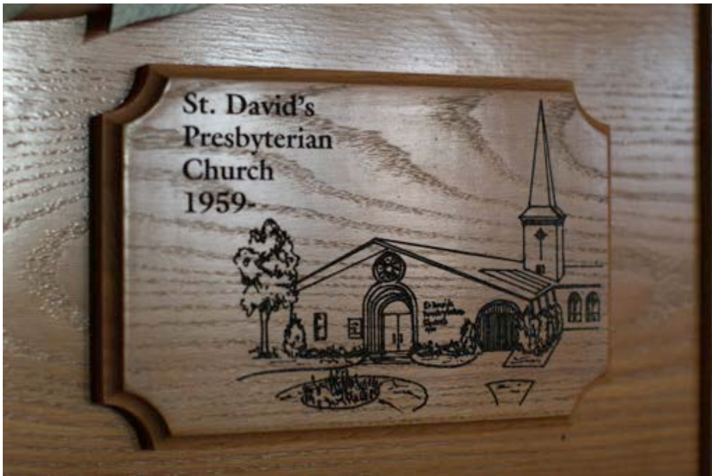
Plaque on Window