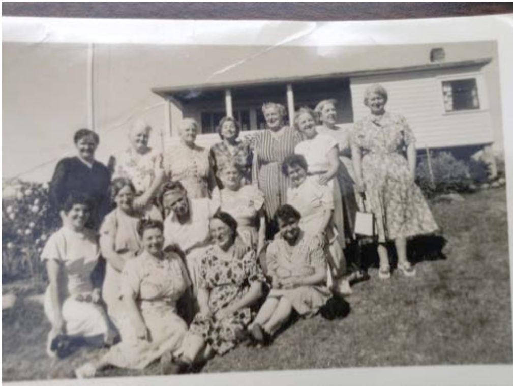
WA or WMS at Beachy Cove