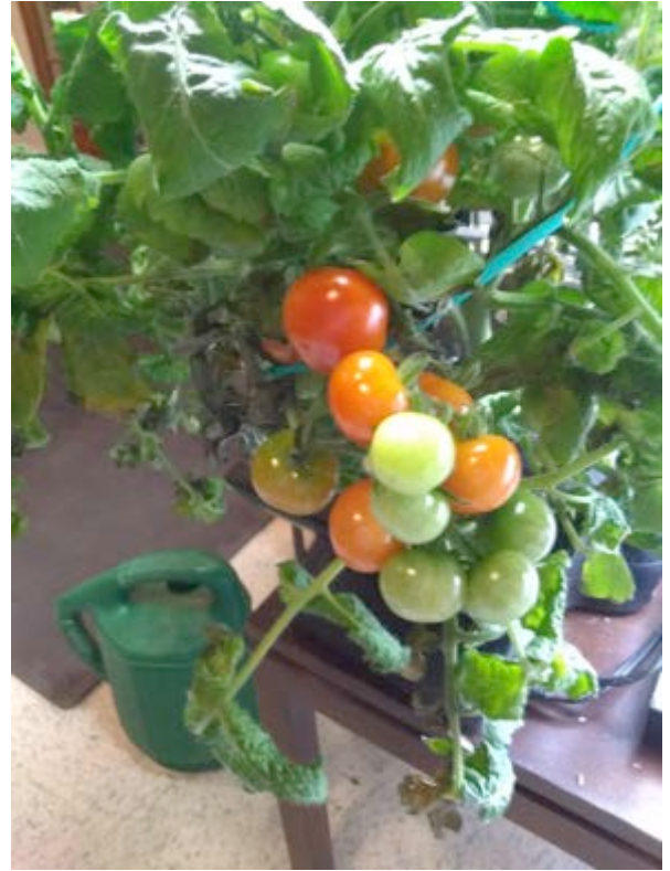
Tomatoes Still on Plants