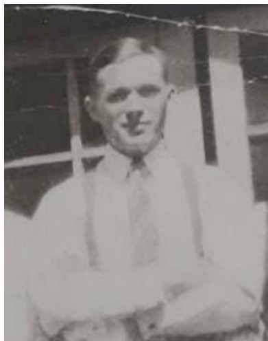
My wonderful Grandfather