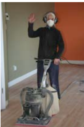
Sanding the Floors