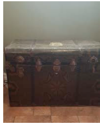
The steamer trunk!