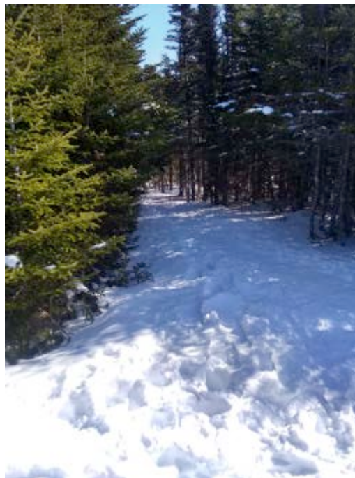
Trail Around Gull Pond

We were delighted to meet Hazel and Robin Gamble walking around Gull Pond today! It was great to see them and have a little “distanced” chat!