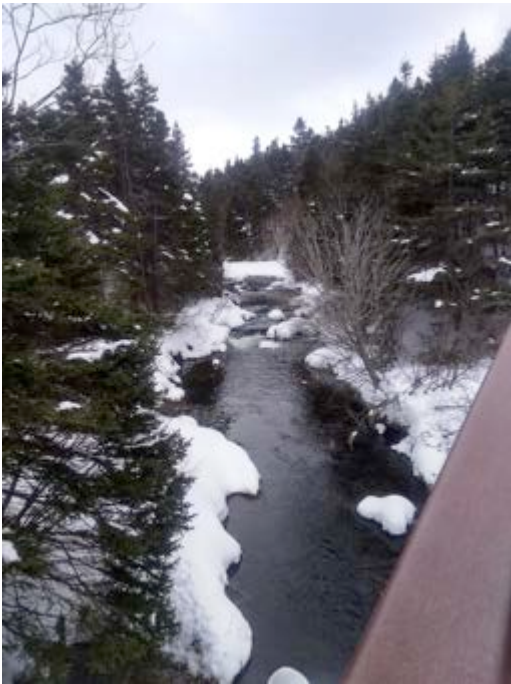
View from Bridge