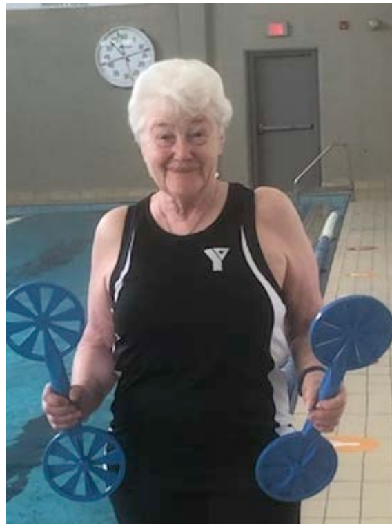
Volunteer of the Year