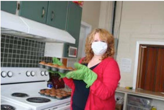
Muffins Coming Out of the Oven