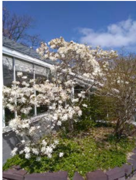
Magnolia Tree in Full Bloom