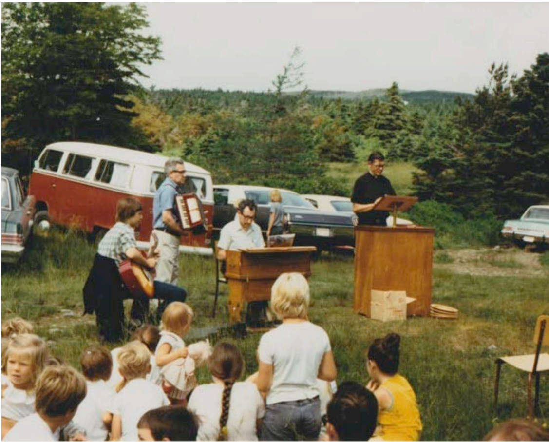
Picnic on the Barnes Family Farm – 1975