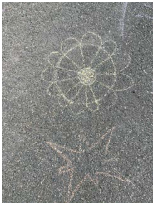
More Spring Art on the Pavement