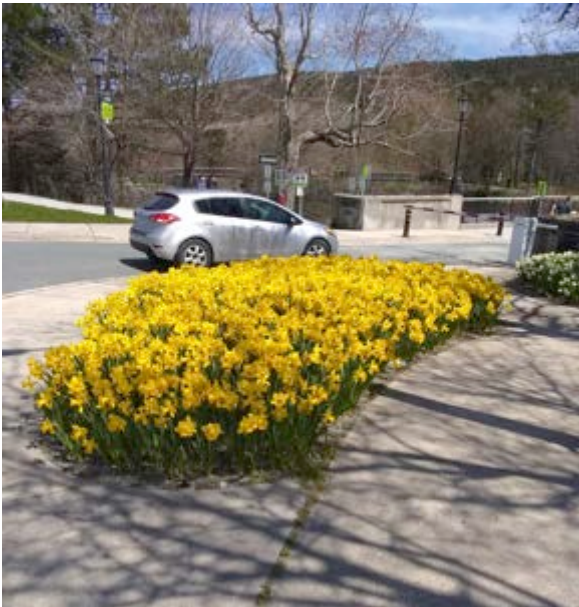
And More Daffodils!