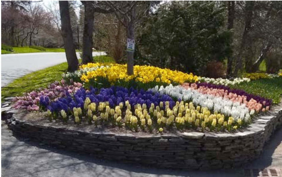
Just Beyond the Main Entrance