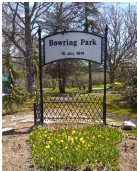
Entering the Park