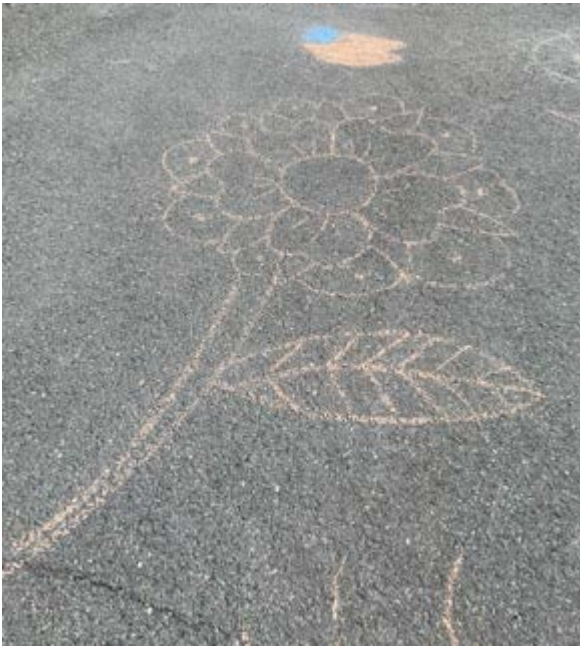
Flowers on the Pavement

When Pam and Penny arrived at the Church last Thursday morning to do some "tidying up" around the grounds, they found some definite signs of Spring! Have a look!