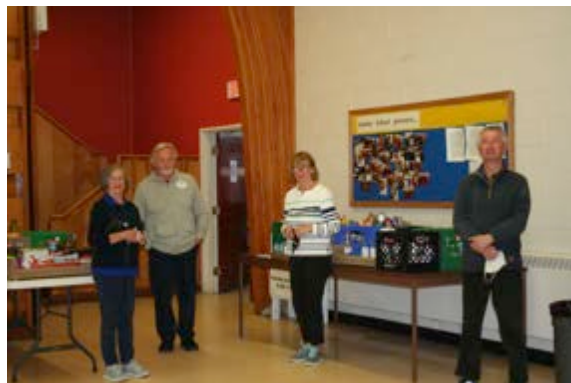
The End of a Great Day!