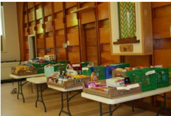
More Crates of Food