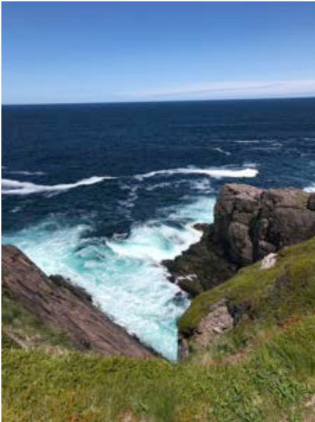
View Along Doran's Lane Hike