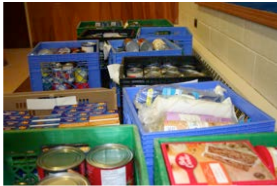
Crates of Food