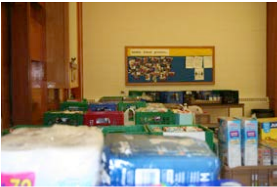
A Sea of Food