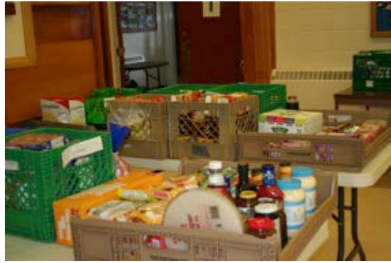
Lots of Donations