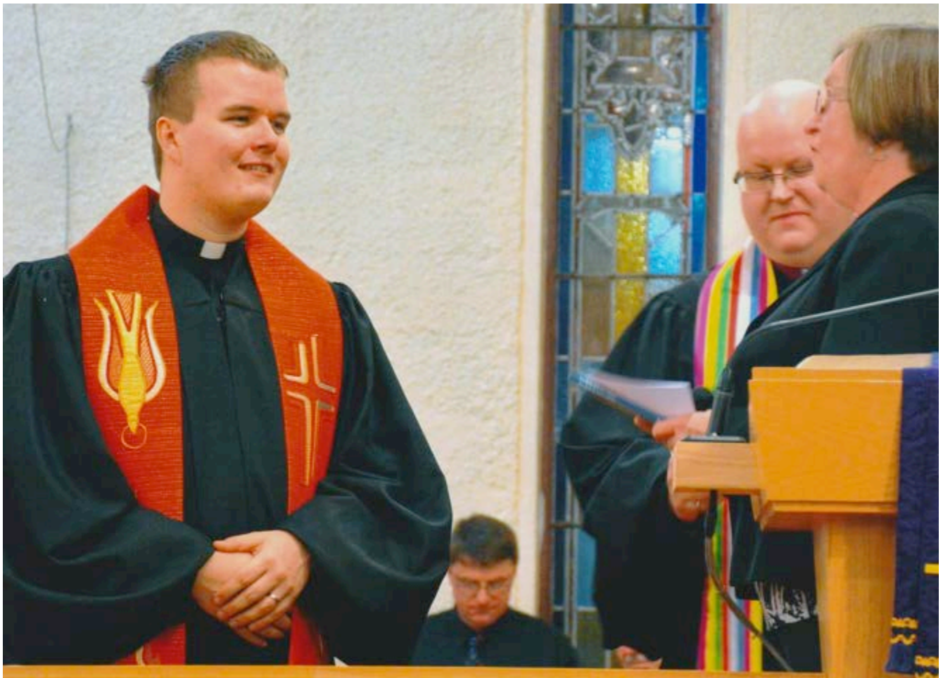
The Minister as Moderator