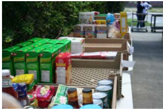
The Crates are Getting Full