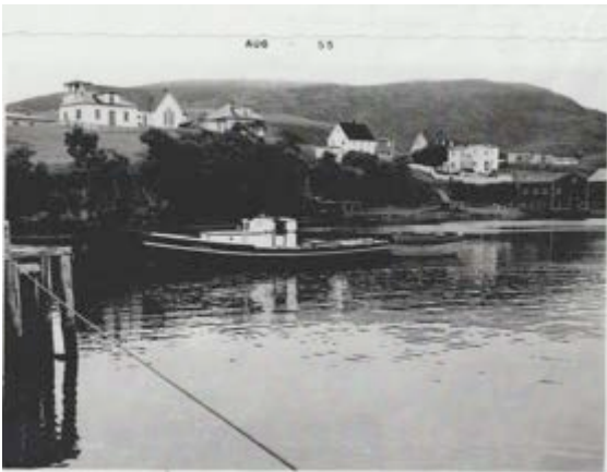
Pool's Cove 1955