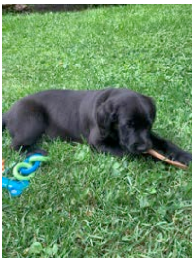
Cleo Munching on Rhubarb

I hope you are enjoying this wonderful weather a bit too hot to garden but perfect for puppy watching. Here is Cleo in our back garden getting used to our home and garden! She is 8 weeks old and is a Cape Shore water dog... a Labrador mix in other words with webbed feet! She is very interested in the hose and the rhubarb not of course her toys!!