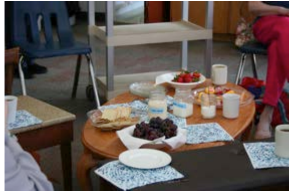
Thanks Beth for all the Goodies!