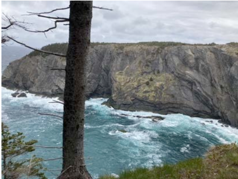
One of Many Coves