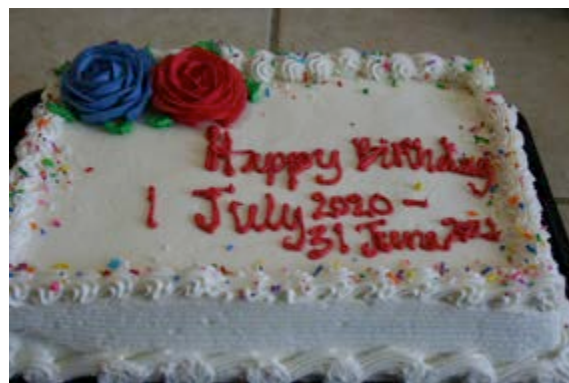
Celebration Cake Compliments of Bouwina