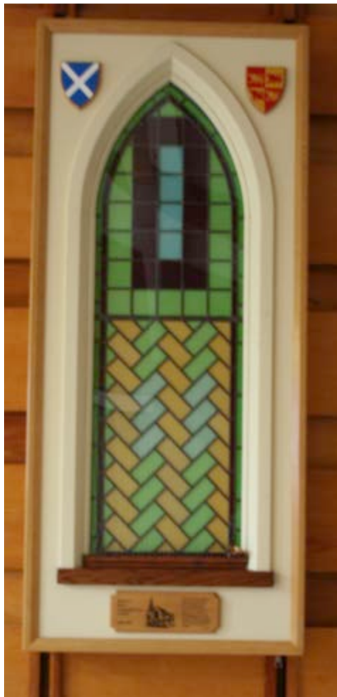
Restored Queen’s Road Church Window >