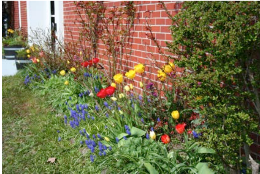
What a Display!