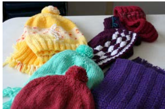
Just Some of the Knitted Goods This Week