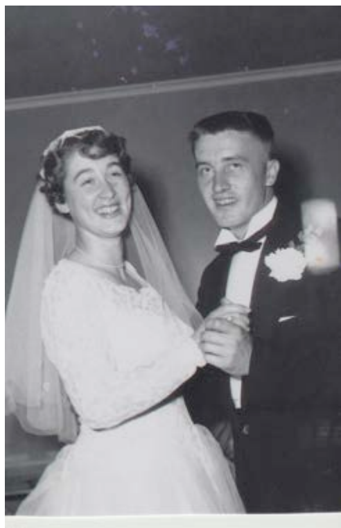
The First Dance