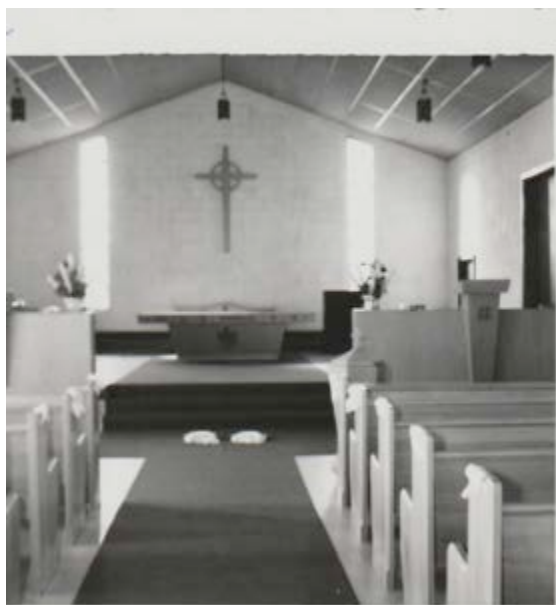
First Wedding in St. David's Church – July 19, 1959 (Notice the cushions on the carpet!)