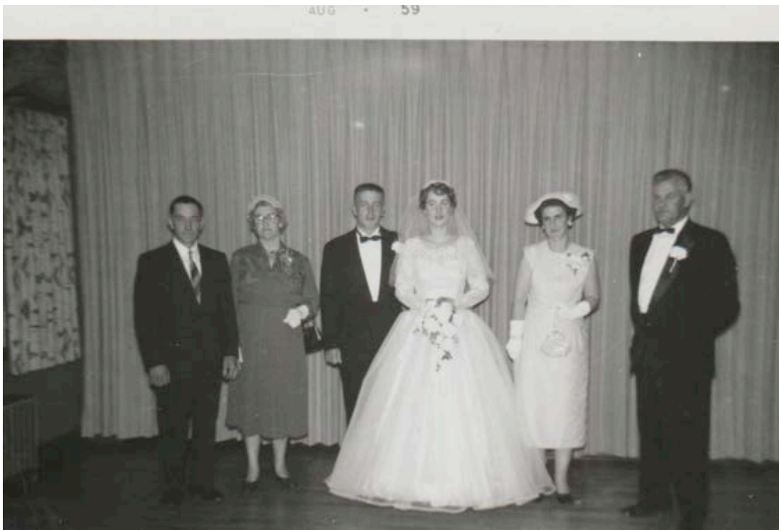
The Bridal Party