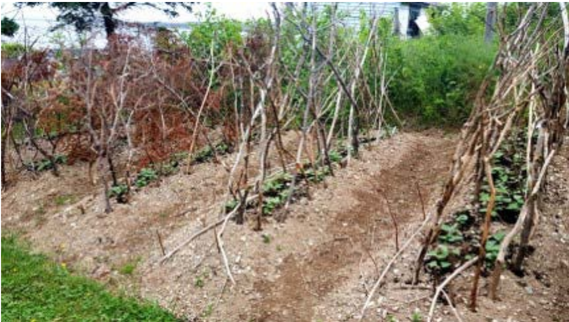
Spruce Tree Boughs for the Beans