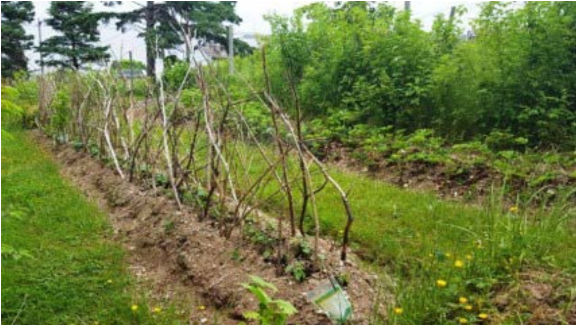
Pole Beans and Strawberry Plants