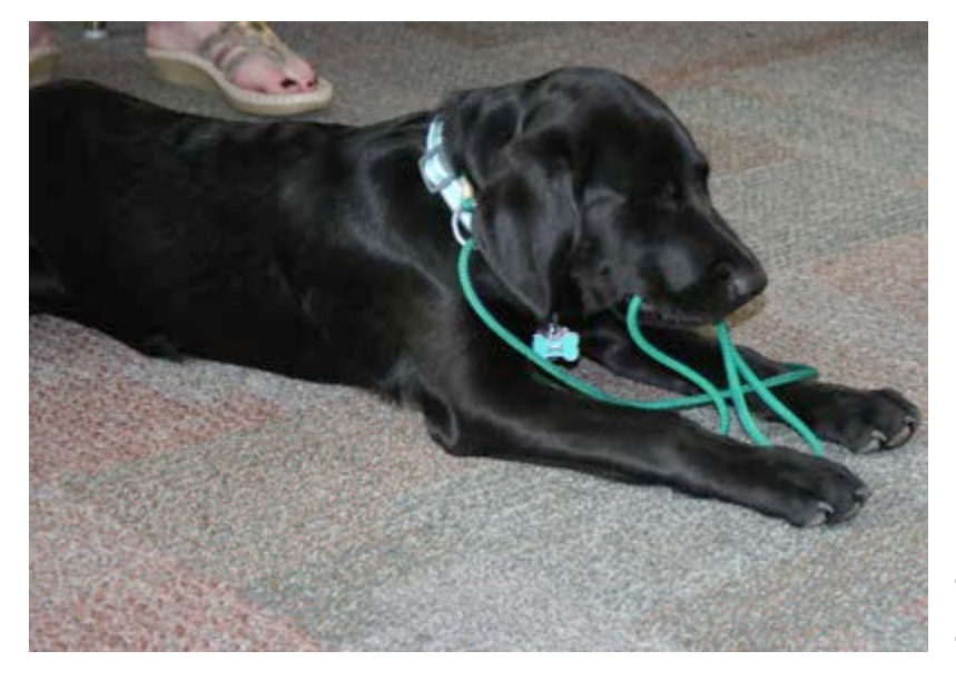
So Much to Chew – So Little Time