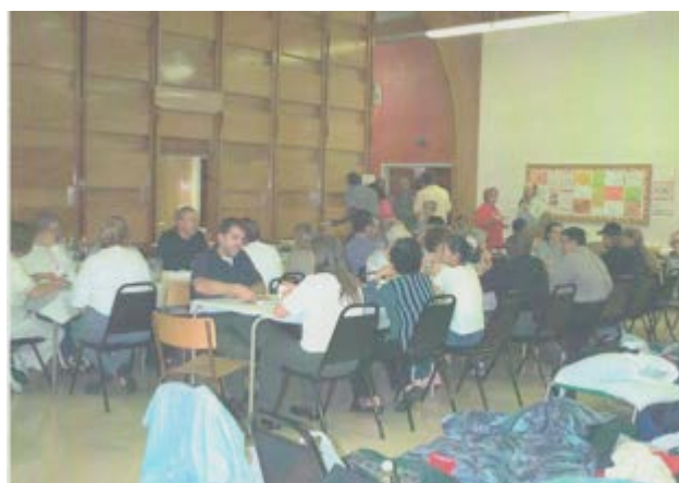
Just some of our Visitors from away