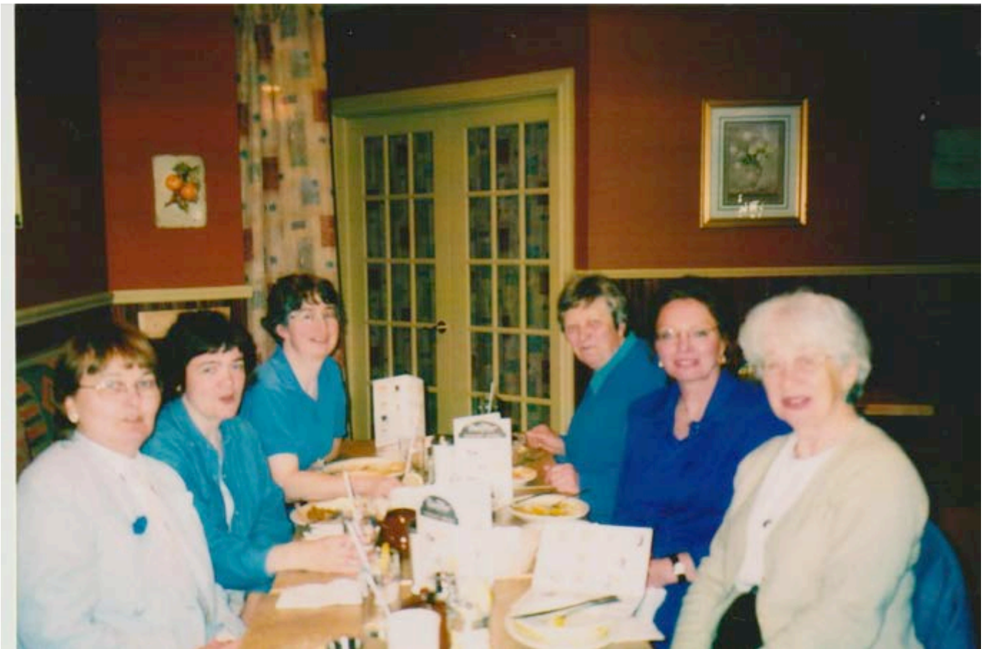
The Bible Bunch at Lunch, 2003