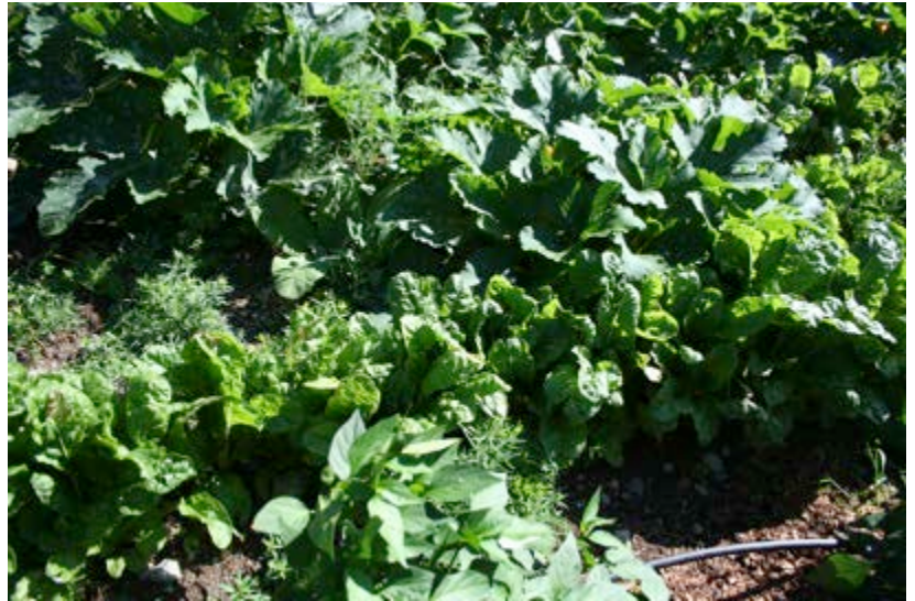
A Row of Chard in the Middle