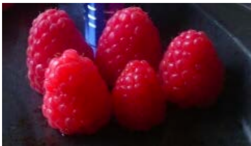
Lady Cove Raspberries – Yummy!