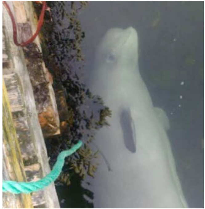
Beluga Whale Playing Near Lady Cove Wharf