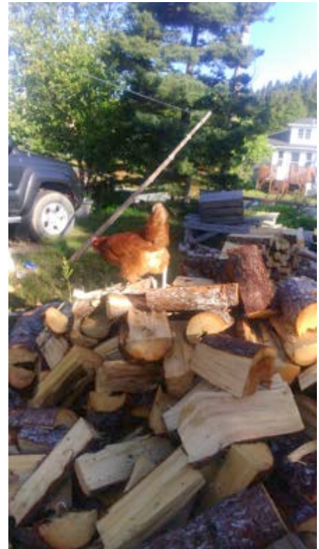
How do I get down