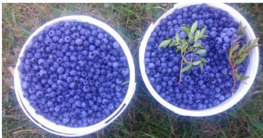
Blueberries from the Blueberry Farm in Britannia

Below are just a few pictures that show the many blessings of the land and the sea.