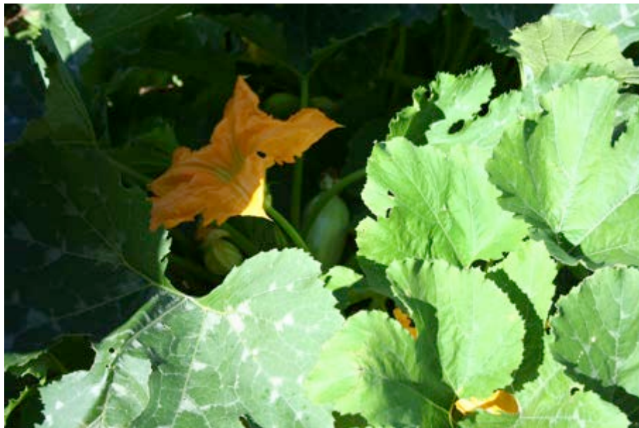
Zucchini Plant – Notice the Grown Zucchini!