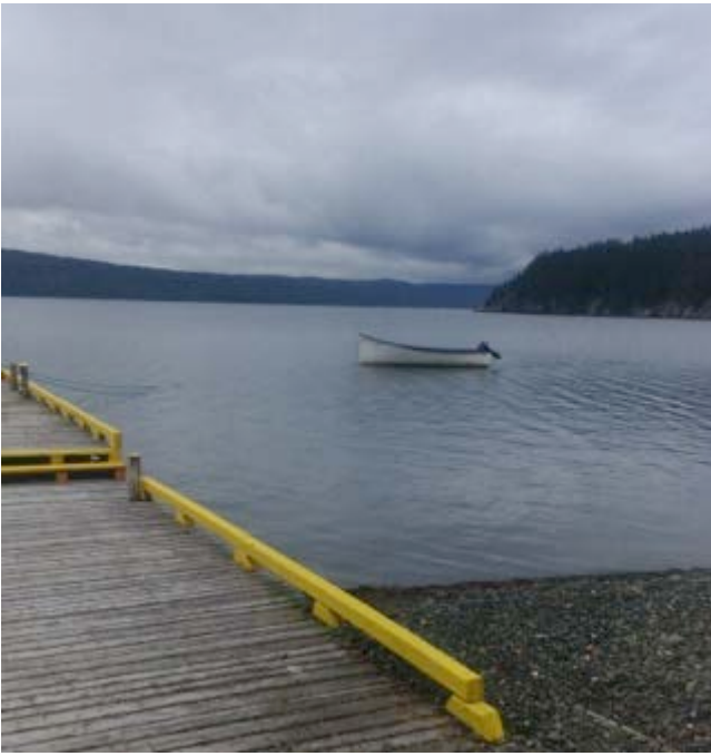
Anne's Boat in Lady Cove