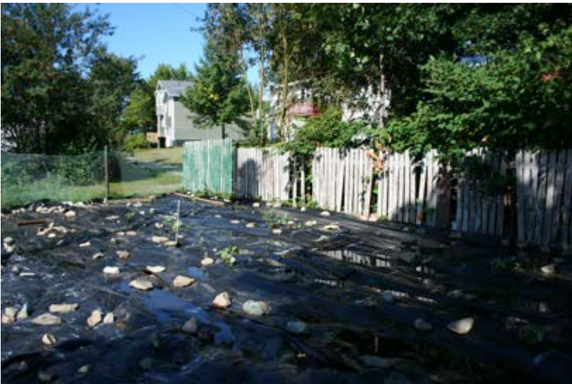
More Things to Come