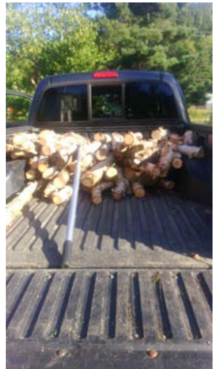
Birch for Town, new use for Peter Clouston's Boat Hook