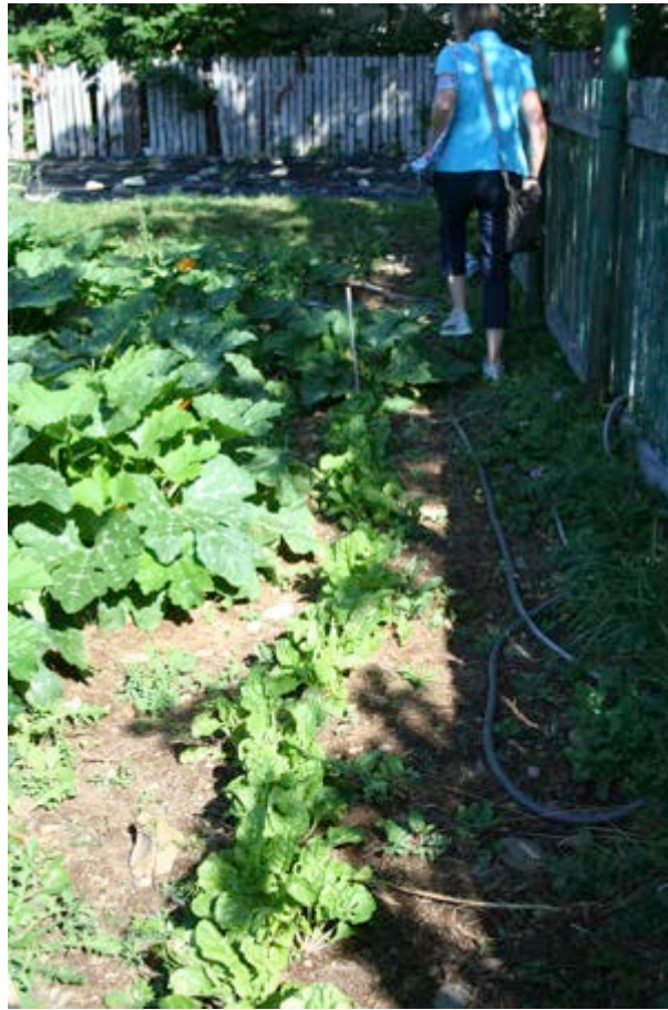
Penny Exploring the Garden