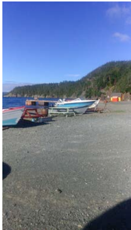
Dory and boats on the beach