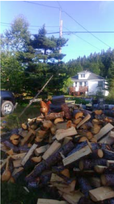
I thought I saw a Caterpillar