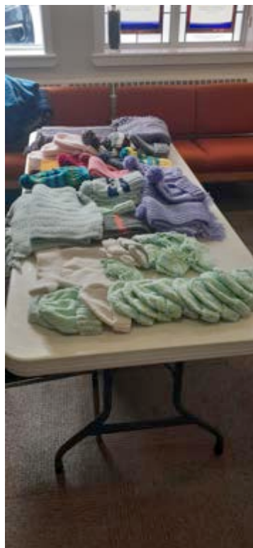
Finishes Like This