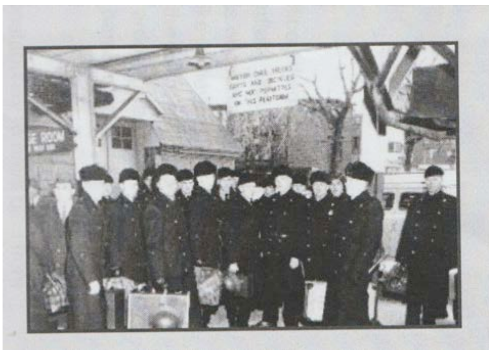
RNC Officers in Central Newfoundland, 1959