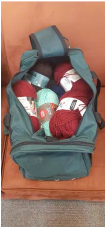
Starts Out Like This...