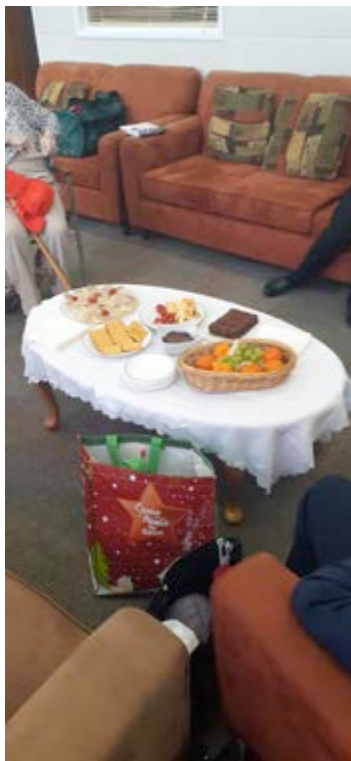
Energy for the Knitters