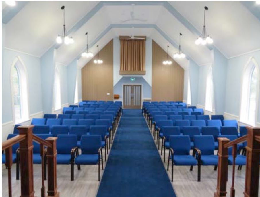
Inside St. Matthew's – Looking Towards the Back