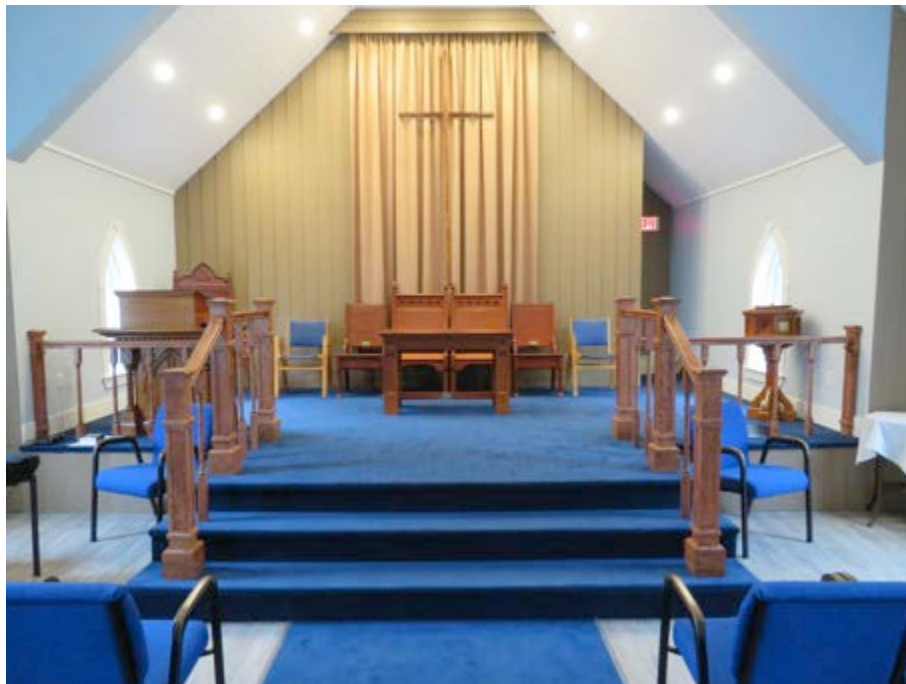
Inside St. Matthew's – Closeup of the Pulpit Area