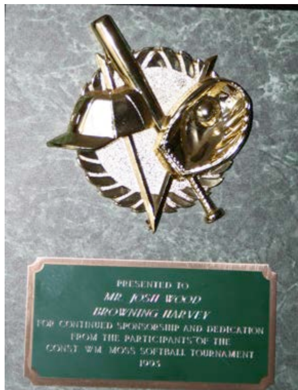
Appreciation Plaque from Browning Harvey, 1993