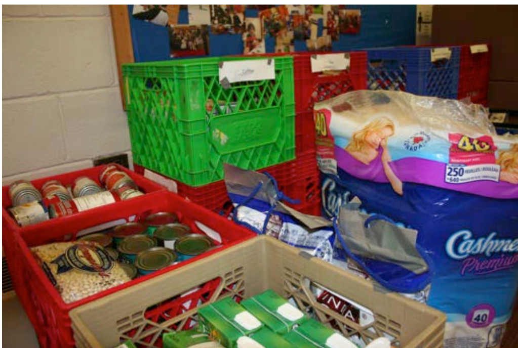
Just Some of the Donations