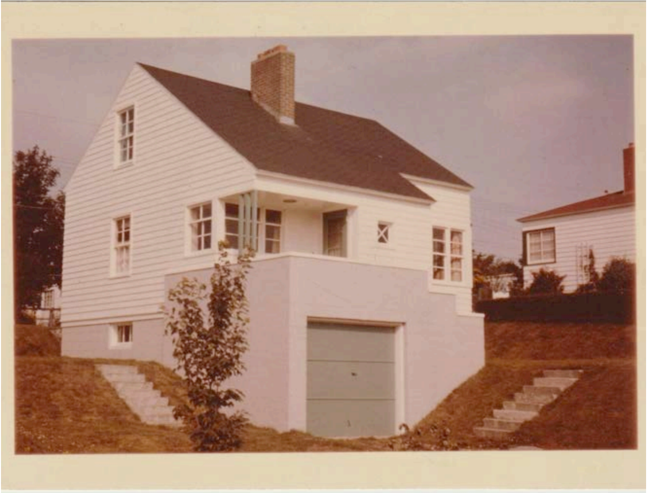
The Armour House, 1966