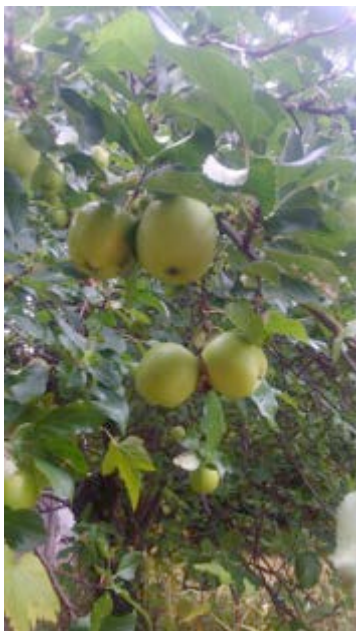
Just Some of the Delicious Apple