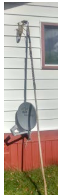
Is That Duct Tape?