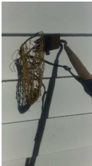
Apple Picker with Net