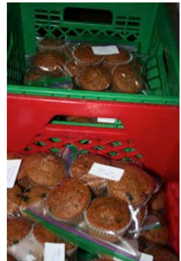
Muffins packed and ready to go to BTH