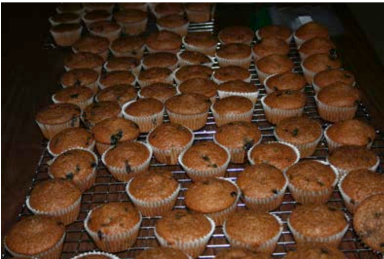
Muffins as Far as the Eye Can See