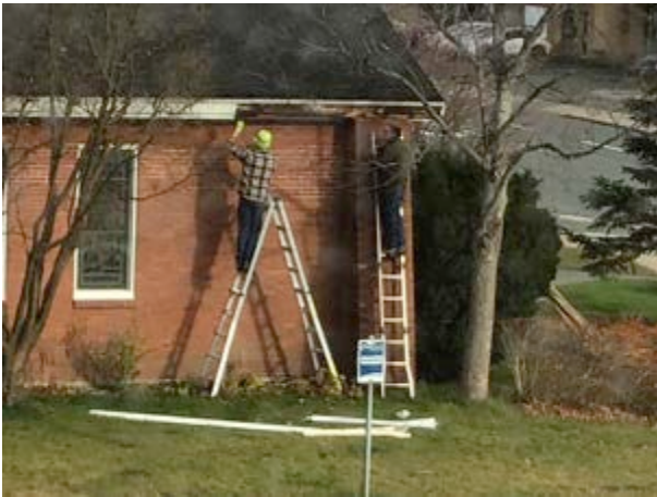
Oh, Oh.... Unexpected Problems