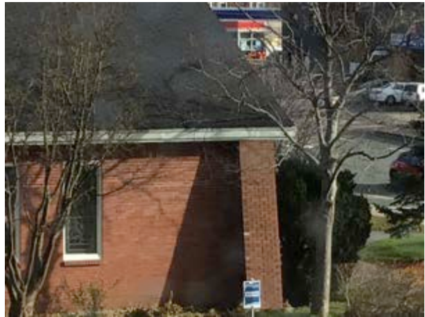
All Done... Repairs Complete