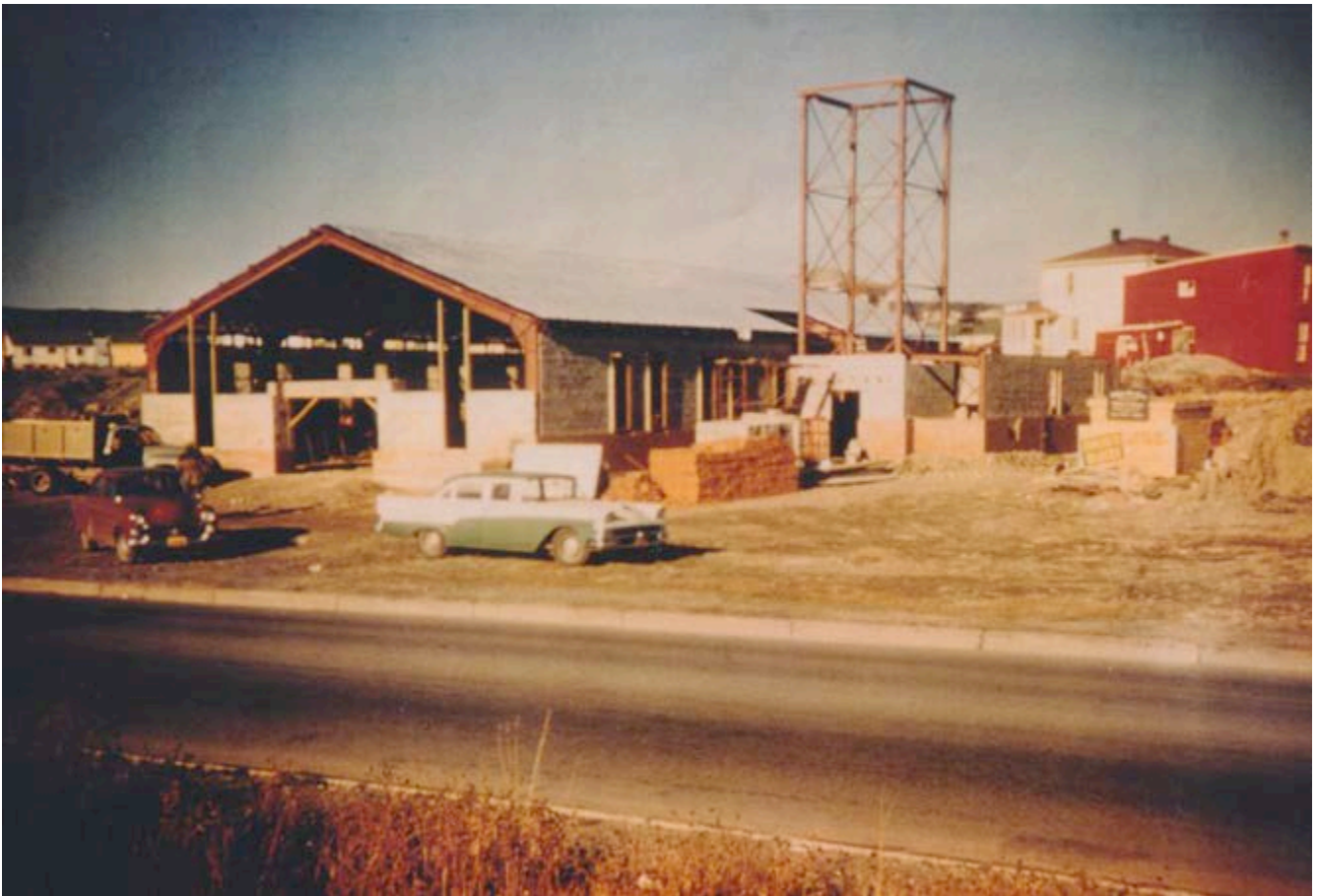
St. David's Under Construction – 1958