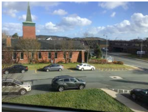
Good as new!