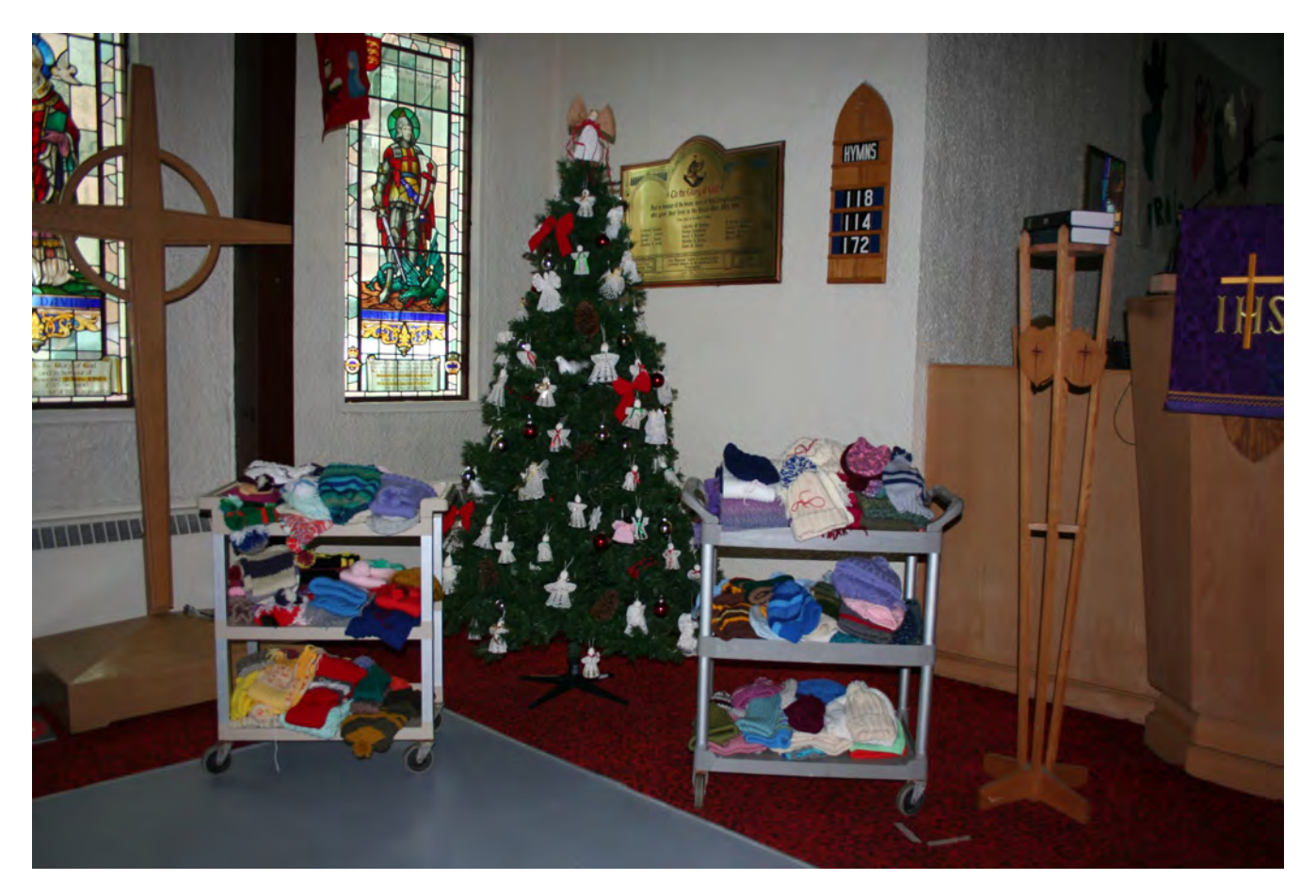
Gifts under the tree

Stella's Circle were absolutely delighted to be offered some of the wonderful knitted goods that have been produced by lots of willing busy hands.