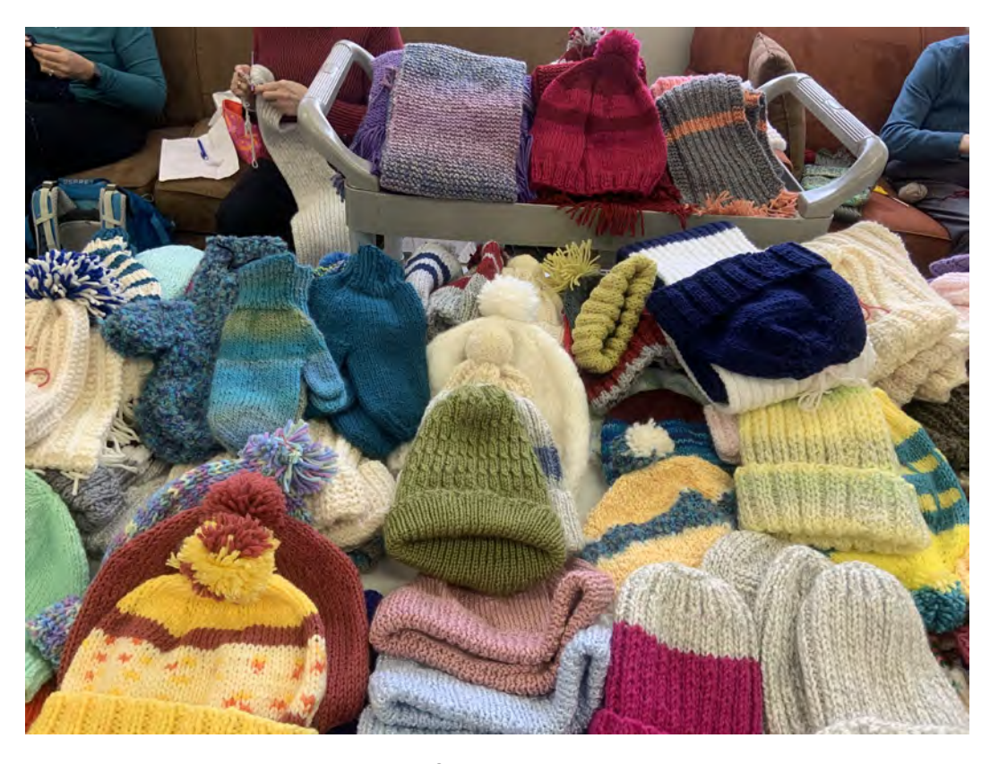
LOTS of knitted goods!