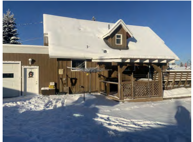
Home in Smithers