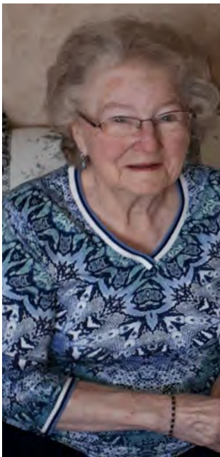
The Birthday Girl!