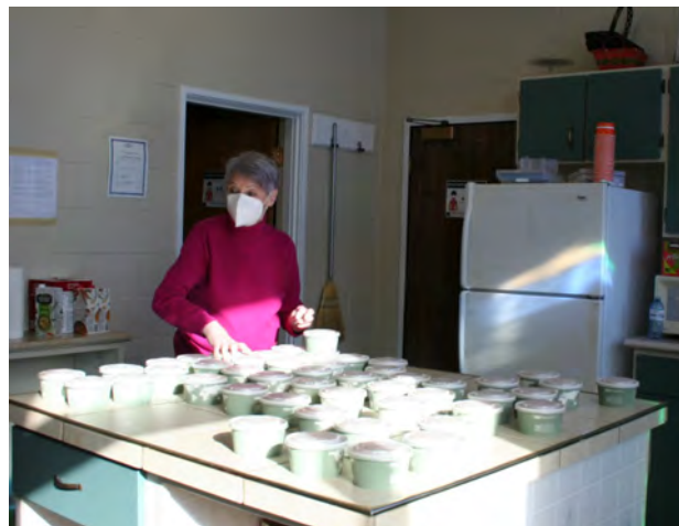
Kay Prepares to Pack the Lunches