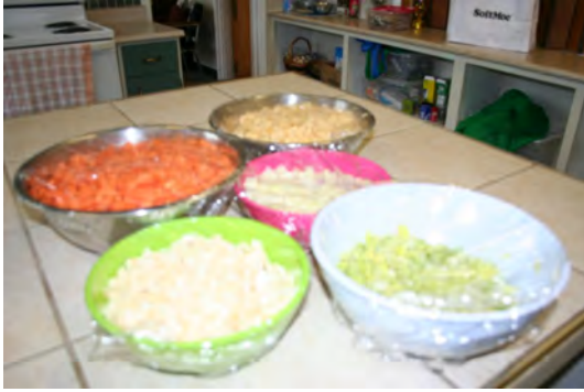
Vegetables Ready for Soup