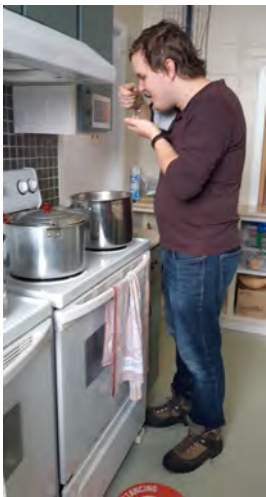
Tasting the Soup – So Important!