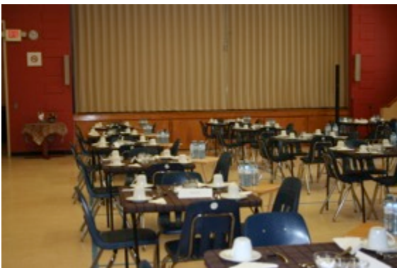
Good to go!!!