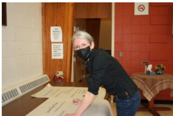
Preparing the Menu...