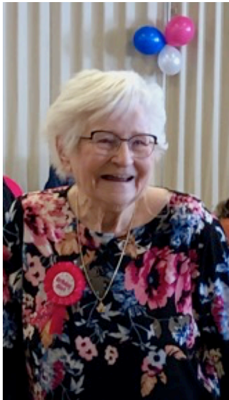
April 2023 Birthday Party