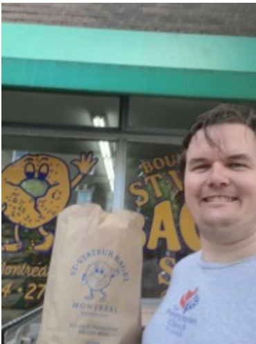
Warm, fresh Montreal bagels from the iconic bagel shop St. Viateur