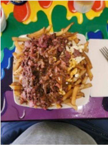
Smoked Meat Poutine at La Banquise It was, without a doubt, too much.